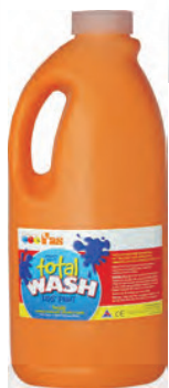
2 Litre All colours 6 per carton FAS Pump available

This paint also washes out of fabrics just by soaking in warm water for 20 - 45 minutes.