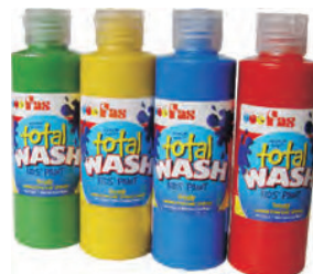
250ml All colours 35 per carton