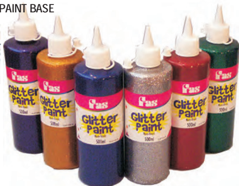
500ml All colours 12 per carton