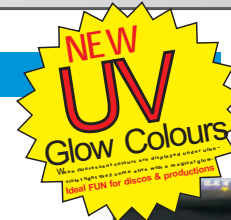
30ml Jar All colours 24 per carton