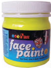
120ml Jar All colours 24 per carton

NON-TOXIC - EASY TO APPLY - COSMETIC PIGMENTED* Smooth thin formulation. A little goes a long way